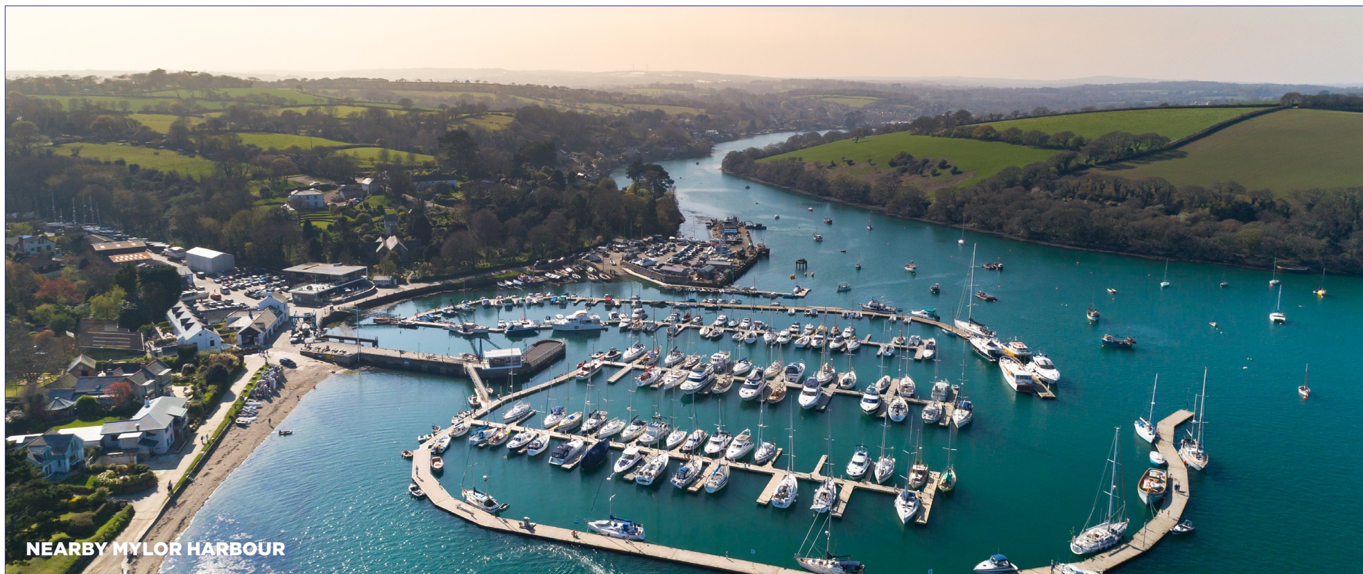
NEARBY MYLOR HARBOUR